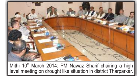
Mithi 10 th March 2014: PM Nawaz Sharif chairing a high level meeting on drought like situation in district Tharparkar.