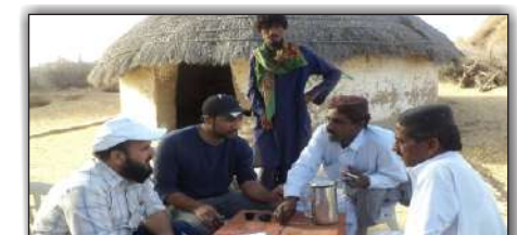
Mithi 15 th March 2014: AD Log NDMA along with NDMA officials during visit to tehsil Dahli, district Tharparkar.