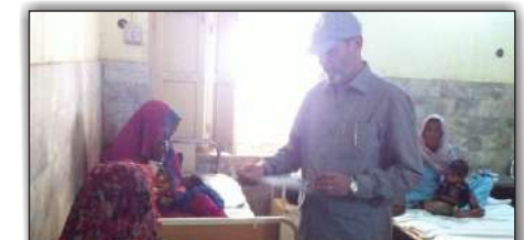
Mithi 09 th March 2014: Chairman NDMA visited the under treatment patients at DHQ hospital Mithi, district Tharparkar.