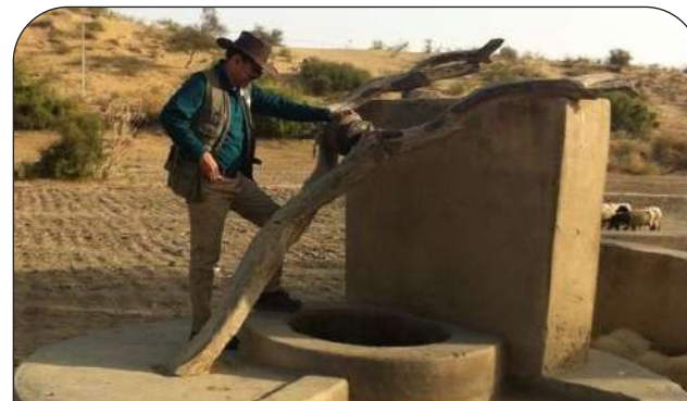
Naukot 11 th March 2014: Member Operations NDMA during inspection of water reservoirs in tehsil Diplo, district Tharparkar