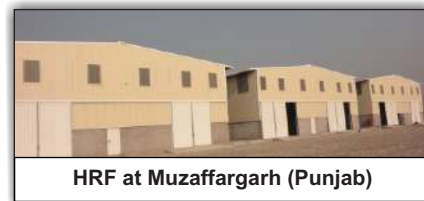
HRF at Muzaffargarh (Punjab)