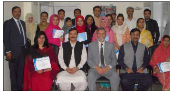
Islamabad 16-18 April 2014: A group photograph of Chairman NDMA along with participants of a three days training course on "Integration of Gender & Vulnerable Groups in DRM"

NIDM also participated in two exhibitions organized by Pakistan Urban Forum at Karachi and Punjab Youth Festival at Lahore. At Punjab Youth Festival, besides showcasing the achievement of NDMA and NIDM, a competition, among the university students on Disaster Resilient Shelters was also adjudicated by NIDM team.