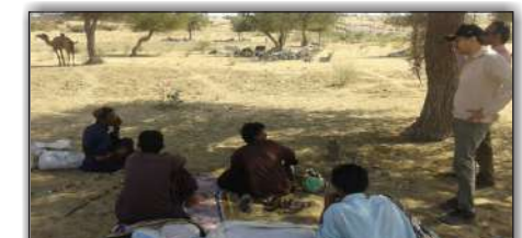
Mithi 09 th March 2014: Member Operations NDMA interacting with drought affectees in Mithi, district Tharparkar.