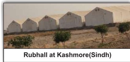
Rubhall at Kashmore(Sindh)

NDMA, in partnership with WFP, is developing a combined network of warehouse facilities ( HRF & Flospans ) at various strategic locations across Pakistan for storage of emergency stock. Recently two mega state of the art HRFs at Muzaffargarh ( Punjab ) and Quetta ( Balochistan ) have been completed on 20 th February and 10 th June 2014 respectively and are functional under PDMA Punjab and Balochistan respectively, while other 26x flospans, are under various stages of construction/installation in various areas. During HRFs handing/ taking over ceremonies Chairman NDMA appreciated WFP for strengthening disaster preparedness and emergency response capacity across the country for stocking reserves, effective & reliable emergency logistics response mechanism at district level. WFP also assisted NDMA in establishing its warehouse at Kashmore (Sindh) comprised of five rubhalls to accommodate strategic emergency stocks.