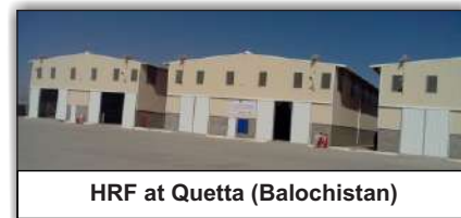
HRF at Quetta (Balochistan)