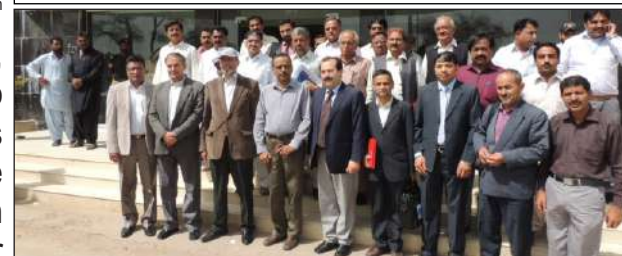
Badin 12 th March 2014: Chairman NDMA during launching ceremony of MHVRA in Badin.