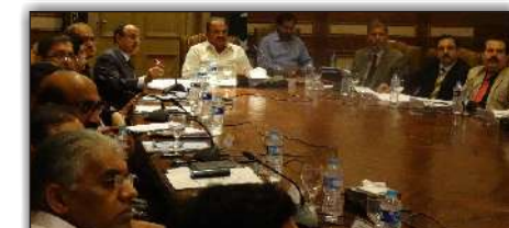
Lahore (Punjab) 30 th April 2014: Chief Secretary Punjab chairing meeting on pre-monsoon preparedness & contingency planning.