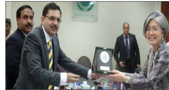
Islamabad 7 th May 2014: Member Operations NDMA presenting a souvenir to United Nations Assistant Secretary General for Humanitarian Affairs/ Deputy Emergency Relief Coordinator, during her visit to NDMA.