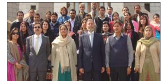
Islamabad 6 th March 2014: Group photograph of Chairman NDMA along with students of Armed Forces Post Graduate Medical Institute Rawalpindi during visit to NDMA.

To orientate and seek the first hand acquaintance, number of trainees from native institutions visit various marked Government/Non Government outfits. NDMA being the forefront and federal agency is one of the pronounced organizations that also hosts and facilitates different educational and training visits of various universities and departments. Trainees of Armed Forces Post Graduate Medical Institute Rawalpindi, Senior Management Course from National Management College Lahore and Foundation University along with faculty members visited NDMA, and were briefed by Operations Wing, NDMA.