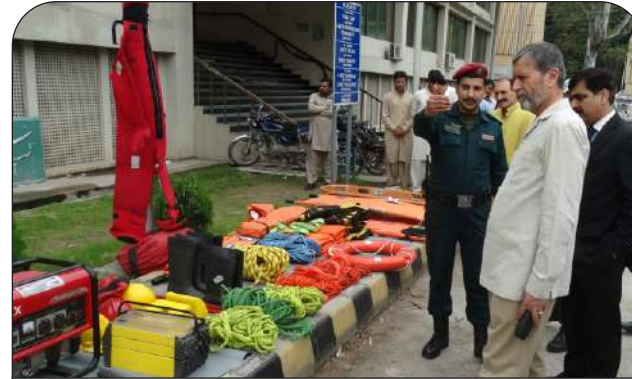
Muzaffarabad 30 th May 2014: District Emergency Officer briefing Chairman NDMA about the capabilities and equipment of 1122 during visit to SDMA, AJK.