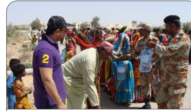
Islamkot 15 th March 2014: Pakistan Rangers distributing relief among drought affectees at tehsil Islamkot, district Tharparkar.