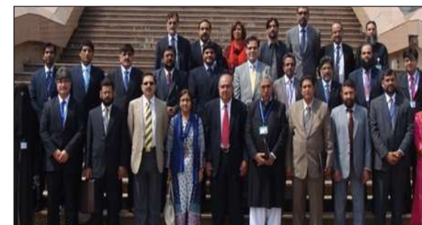
Islamabad 21 st April 2014: Group photograph of Member Operations NDMA along with participants of 15 th Senior Management Course from National Management College.