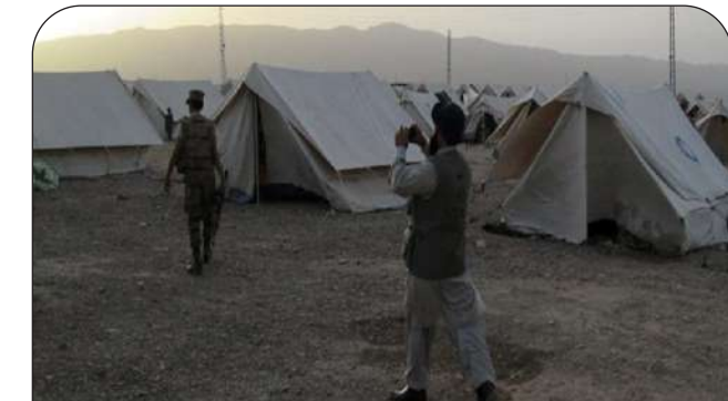
Bannu 23 rd June 2014: Relief Camps established at district Bannu, UC Bakkakhel (KP) for the displaced persons.