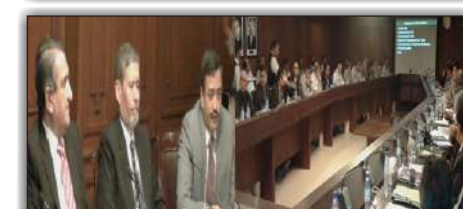
Karachi (Sindh) 19 th May 2014: Chief Secretary Sindh & DG PDMA Sindh briefing on the contingency planning.