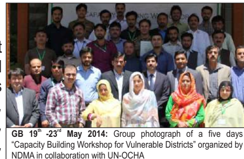
GB 19 th -23 rd May 2014: Group photograph of a five days "Capacity Building Workshop for Vulnerable Districts" organized by NDMA in collaboration with UN-OCHA

NDMA commenced Phase-II of capacity building trainings of Govt Officials in vulnerable districts in order to ensure well coordinated efforts during monsoon 2014. In this regard, training workshops were held in vulnerable districts of Balochistan ( Bolan, Jhal Magsi, Khuzdar, Sibbi, Loralai ) & KPK ( Abbottabad, Haripur, Battagram, Mansehra, Bannu, D.I. Khan, Malakand & Upper Dir ), Punjab ( Chiniot, Mandi Bahaudin, Sahiwal & Kasur ), Sindh ( Sukkur, Shikarpur, Tando Allah Yar, Mirpur Khas,