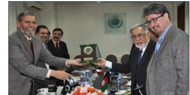
Islamabad 13 th January 2014: Chairman NDMA presenting a souvenir to DG ANDMA during his visit to NDMA.