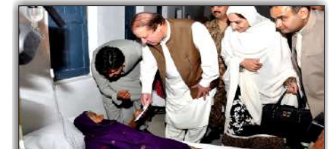
Mithi 10 th March 2014: PM Nawaz Sharif distributed cheques amongst the drought affectees at Mithi, district Tharparkar.